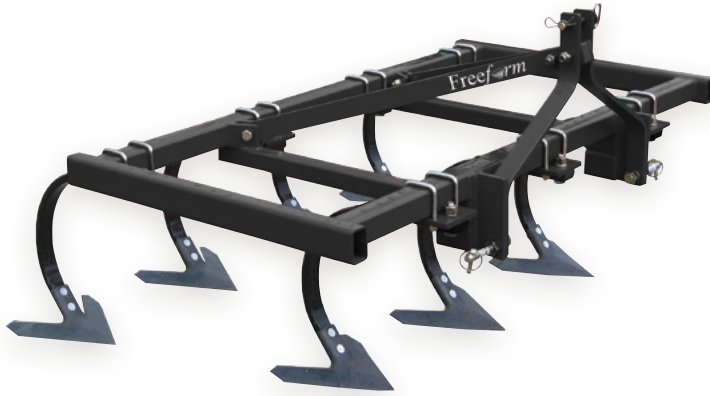
MODEL 1000 CULTIVATOR